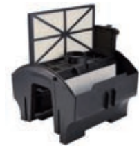
Top access to filter panel for simple maintenance. The filter panel is easy to remove, easy to clean and easy to replace.