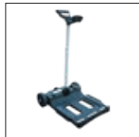
The supplied trolley allows you to move and store the cleaner quickly and easily.